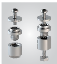
Jack screws standoffs (JSO)