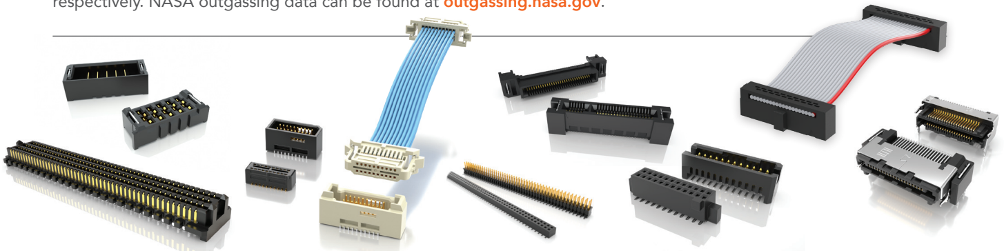
Micro Rugged Connectors & Cables • High-Speed Mezzanine • High-Density Arrays • Micro Pitch Connectors • Micro Power Discrete Wire & IDC • High-Speed Hermaphroditic Strips • High-Speed Edge Card Sockets

The weight of the sample is taken before and after the experiment and the materials are considered to have passed if the total mass lost (TML) and the collected volatile condensable materials (CVCM) are below 1.0% and 0.10% respectively. NASA outgassing data can be found at outgassing.nasa.gov .