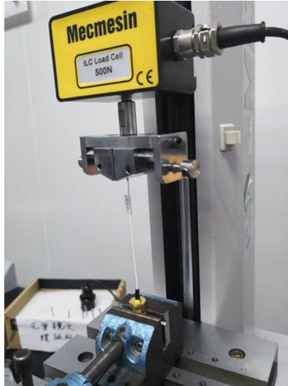
Fig. 1 0° Cable pull