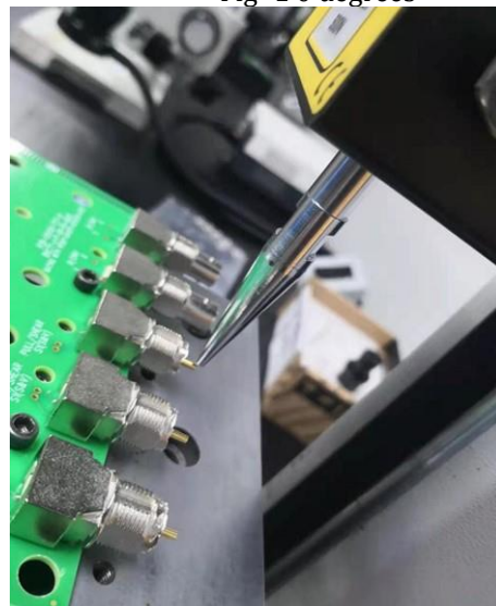
Fig -2 90 degrees