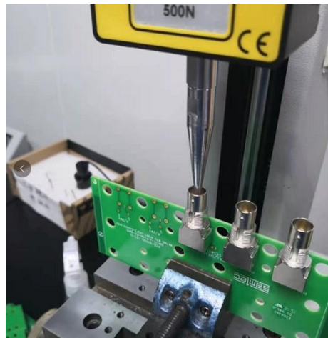
Fig -1 0 degrees