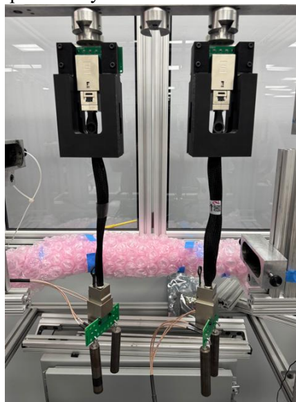
Fig. 2 (Setup picture)