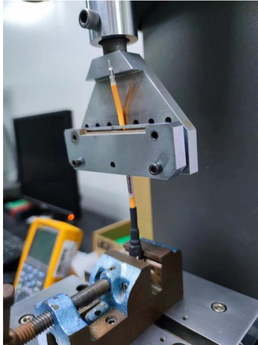
Fig. 1 0° Connector pull