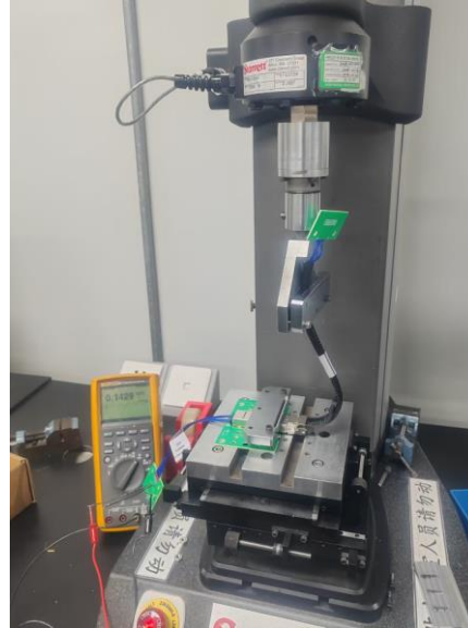
Fig. 2 90° Connector pull.