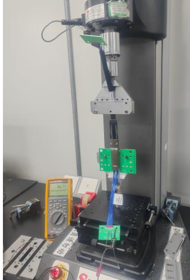
Fig. 1 0° Connector pull.