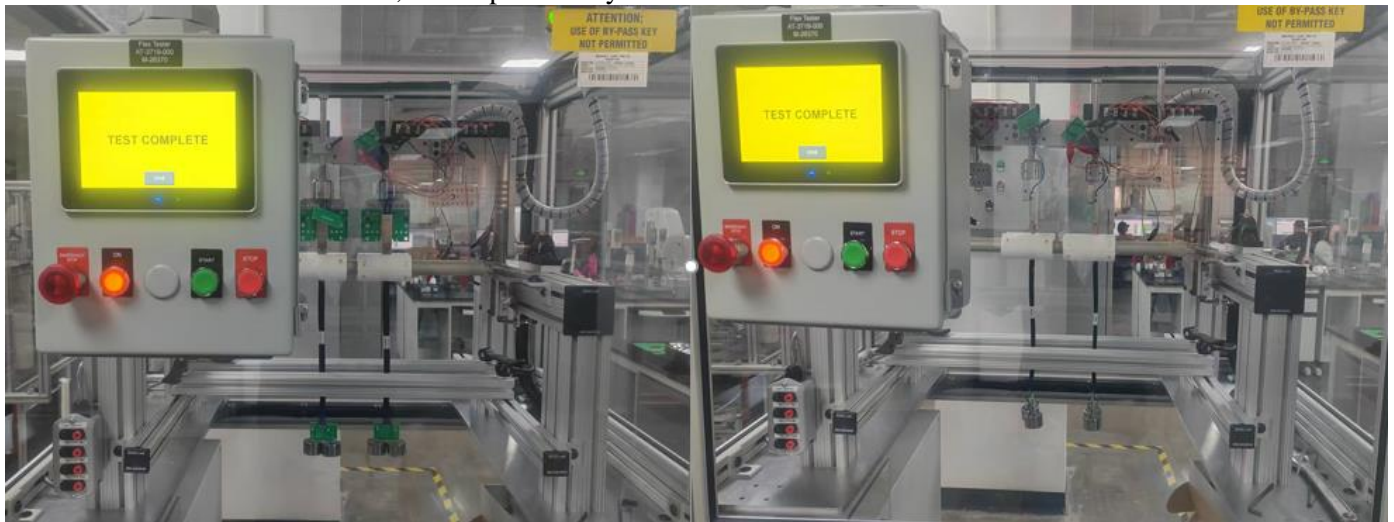
Fig. 3 (Standard setup)