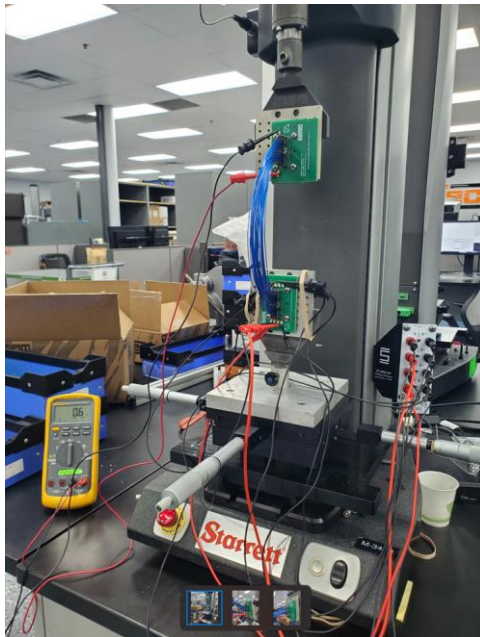
Fig. 2 90^\circ Connector pull-Vertical