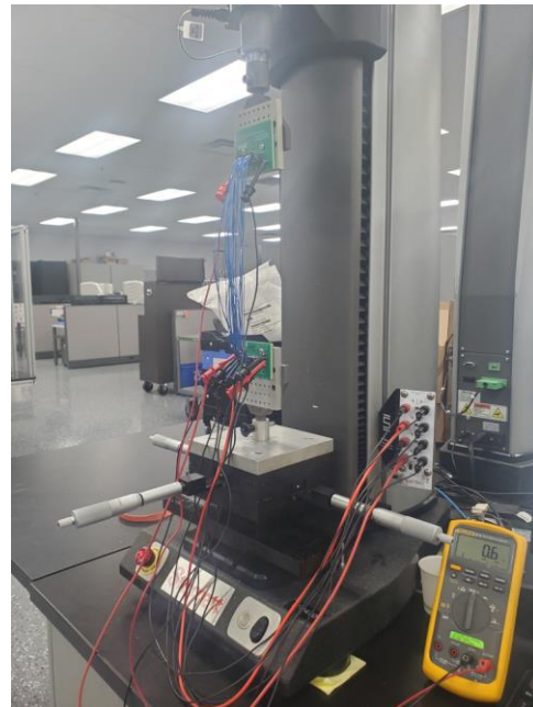
Fig. 3 90^\circ Connector pull-Lateral