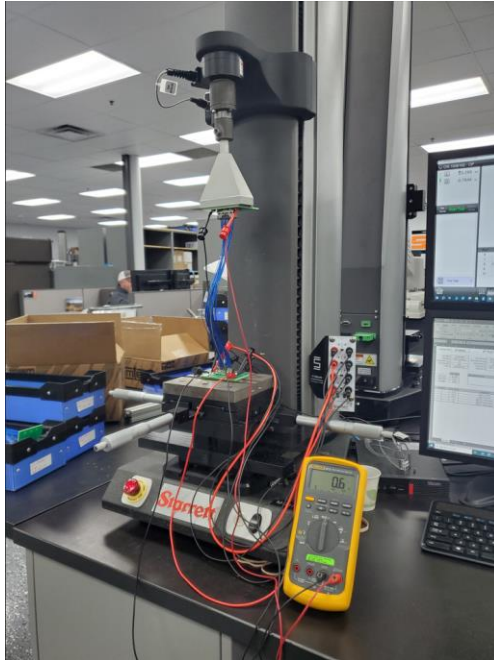
Fig. 1 0^\circ Connector pull