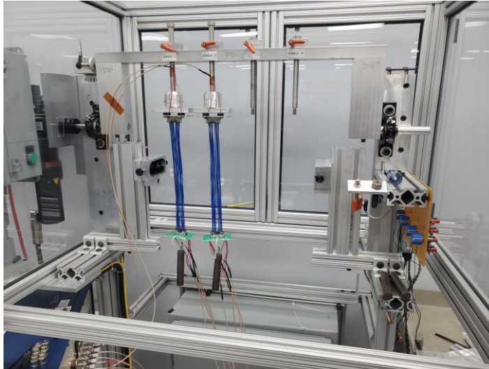
Fig. 4 (Setup picture)